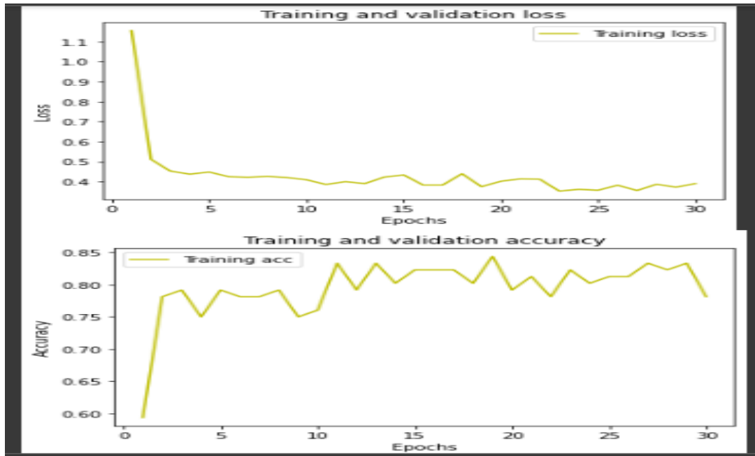
Figure 1: Comparison of Loss and Accuracy with Training and Validation Loss